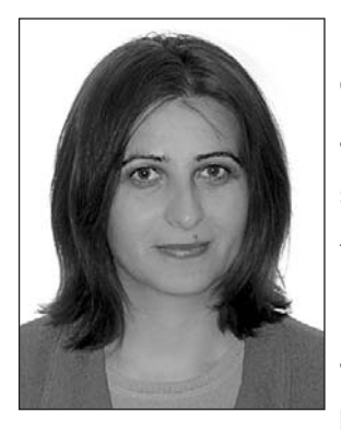
By Magda Pantelidou

Gestalt theory makes an important differentiation in comparison with other approaches: it gives conflict value and stresses not on conflict resolution but on the way it is being handled with.